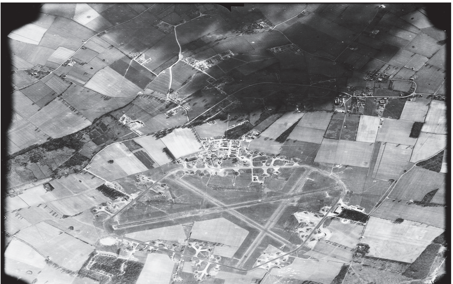
Aerial photograph of Knettishall airfield looking south, the bomb dump is bottom left, 13 March 1944.