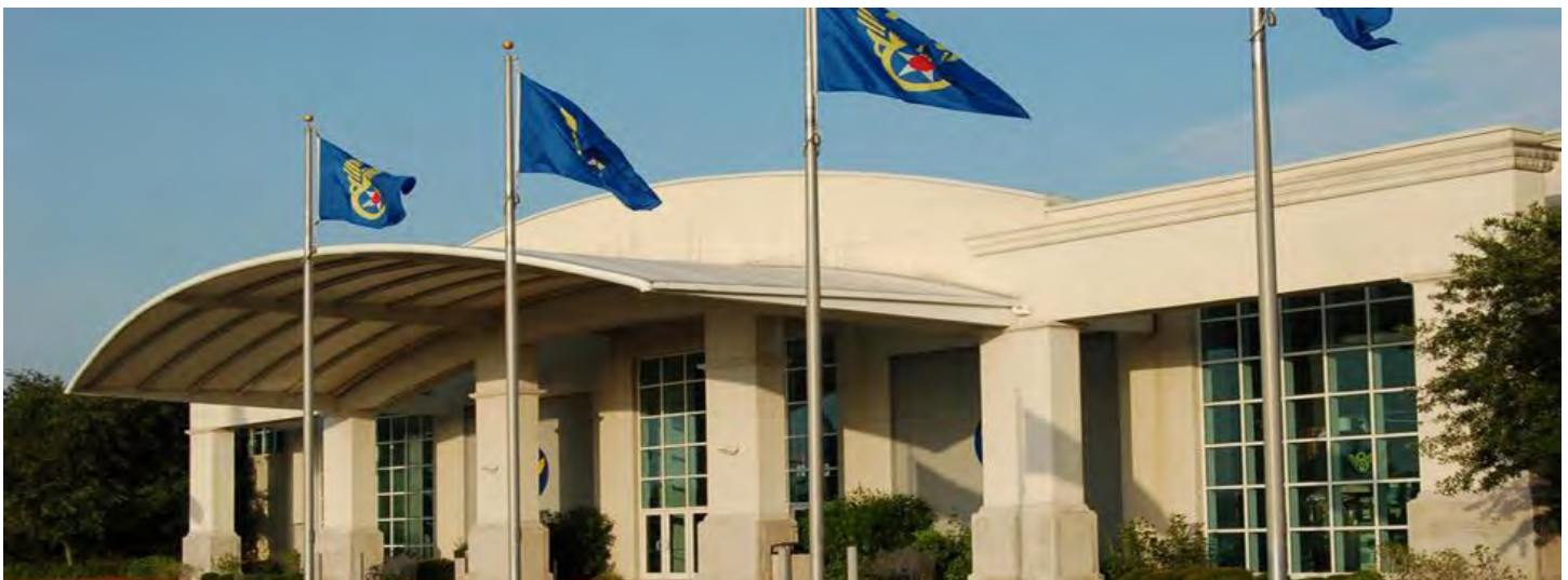
Mighty 8th Museum...YOUR MUSEUM!!!