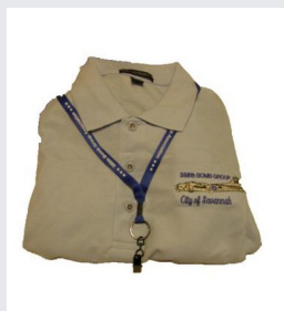
POLO SHIRTS $25.00