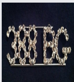
RHINESTONE PIN $12.50

Each of the above items is plus shipping costs.