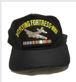
HATS $15.00 each