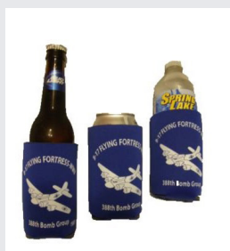
KOOZIE AND LANYARD $2.00 each