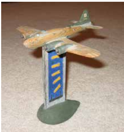
B-17 Model with H

This was carved from bed slats. It is complete to crew members and the power-gun turrets are movable.