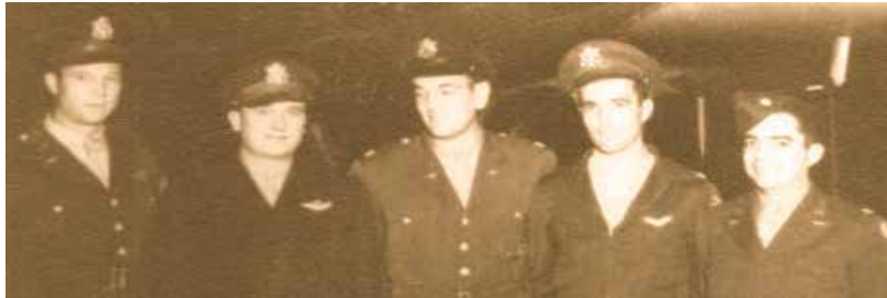
In August 1944, Major Glenn Miller (center) and his orchestra came to entertain us at our field. Afterward, he christened our plane Moonlight Serenade after a song he had written. Then we took turns having our pictures taken with him.